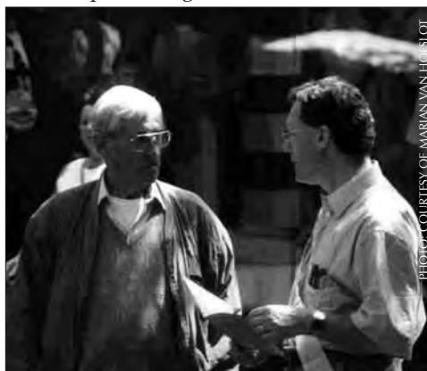
Reaching out to the parents' generation

week later in Nijmegen, two hundred young people signed the pledge. The following Saturday, June 19, in Breda, another 233 inspiring young people signed, and on June 26, in Tilburg, 236 signed! After working three times with a team in Tilburg, Nijmegen and Breda, the couples living in those cities will