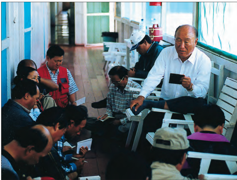
Father instructs the South American national messiahs he had invited