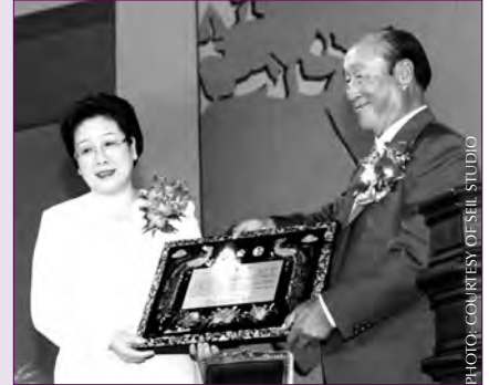
Mother's sacrifice is publicly proclaimed

June 14, 1999 (May 1 by lunar calendar) 37th True Day of All Things Sun Myung Moon, Founder Family Federation for World Peace and Unification Interreligious and International Federation for World Peace