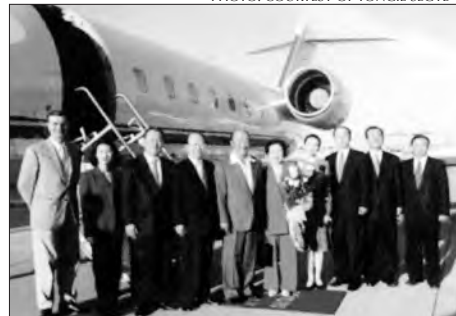
With Mother at the plane on her return to America at the end of her tour