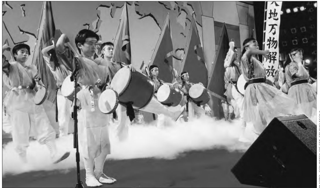
A special entertainment program followed the main celebration at the gymnasium

Can God deal with this? That bitterness originated in Adam's family because of sexual misconduct, and has spread from that time onward. That was the time of spring in the Garden of Eden. The spring season was Adam and Eve's youth, when they were about 15 or 16 years old. Despite the fact that they would have married a few days later, they fell. Because the lineage became fallen, the body centered on love became dirty. Could God possibly use such people for His body? He had to turn His back on them.