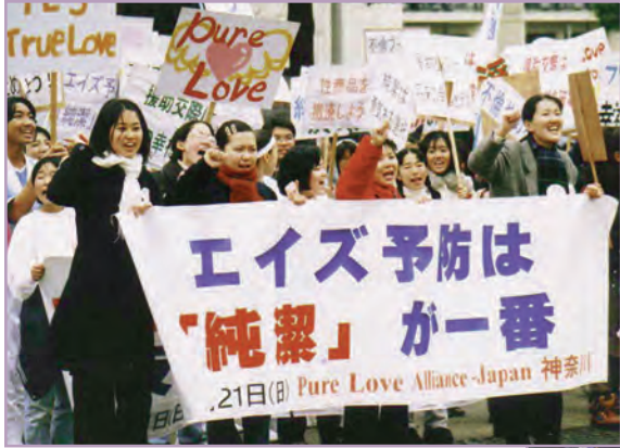
Photos: The Pure Love Alliance in action in Japan earlier this year

From his introduction to the Japanese Pure Love Alliance book