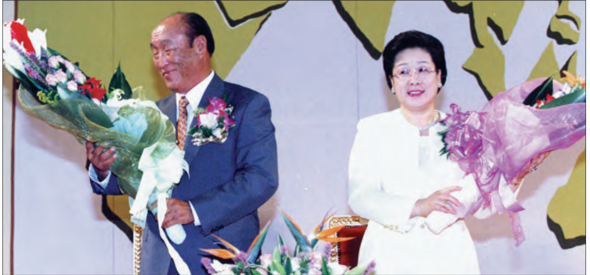
Father and Mother receive a bouquet of flowers in honor of the occasion